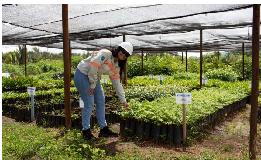
Figure 3 – Plant Nursery on Site at Jaguar

During the period, the Company planted over 5,000 native species seedlings (Figure 3) for the revegetation program of previously cleared farmland. The planned revegetation will allow new forest corridors to be established around the site to assist with the movement, protection and biodiversity of flora and fauna.